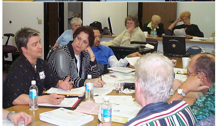
National Testing Committee at work in February at offices of Arizona Board of Cosmetology.